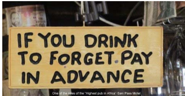
One of the rules of the “Highest pub in Africa”- Sani Pass Motel Lesotho

On the way to Durban for the Nationals tournament, some went via Lesotho. Here are a few of the lighter moments on the trip.