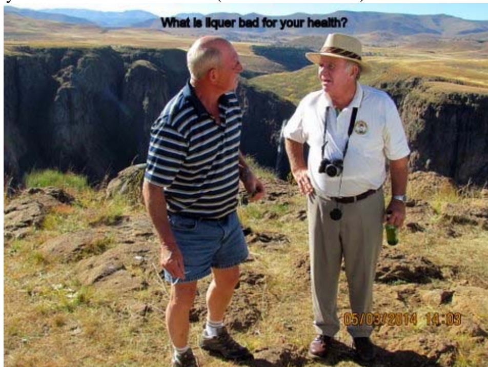
What, liquor is bad for your health?

And a difference of opinion happened on the edge of the crater formed by the Maletsunyane river and the waterfall (196 metre free fall):