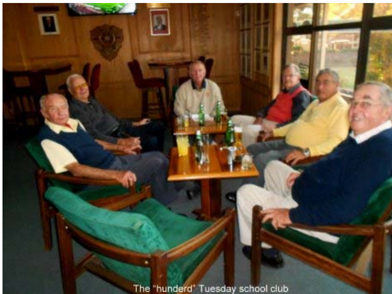
The "hunderd" Tuesday school club

On Tuesday 27 May, two fourballs played and both scored more than one hundred BBS points (4BA two to count). Well done!